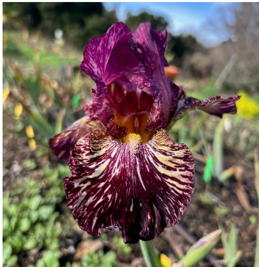
Sir Lines Alot (A Door Prize Iris – perhaps in Feb)