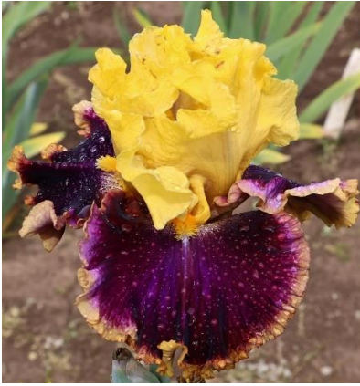
ROMANY ROGUE (Remare by Keppel 2024) TB, 36", M. Standards dandelion; falls shoulders mixed dahlia purple and tapestry red washing down and almost totally covering wisteria violet, 3/16" mustard edge, small light yellow area speckled shoulder color beside beard; beards deep chrome yellow throat, deep chrome yellow middle, cadmium yellow end; slight sweet fragrance.