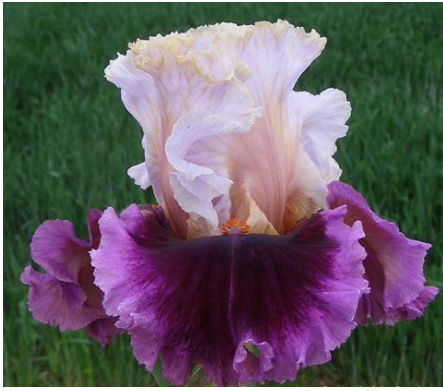
STYLE MAKER (Sutton 2022) TB, 37", M-L. Standards palest red-purple, darker veining at midrib, almond veining near edge, ¼" almond rim; falls dark violet, 1½" lighter violet-purple band at edge; beards orange; ruffled; serrated; slight sweet fragrance.