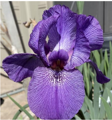
CHIHUAHUA EVENING (Dash 2024) AB, 23", M. Standards lavender veining on light lavender background; falls lavender veining on light lavender background, diffuse black on white signal; beards dark brown.