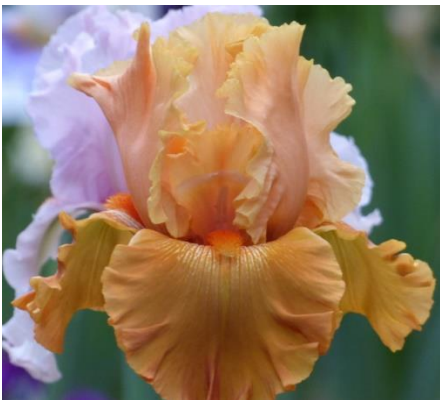
MAI TAI JOIN YOU (Schriener 2024) TB, 38", M. Standards light orange; style arms light orange;

falls burnt orange; beards burnt orange; slight fragrance.