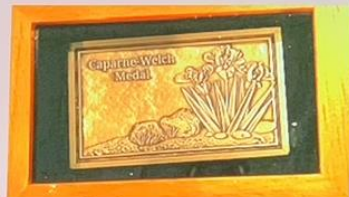
Miniature Dwarf Bearded Wee Dragons Lynda Miller 2017