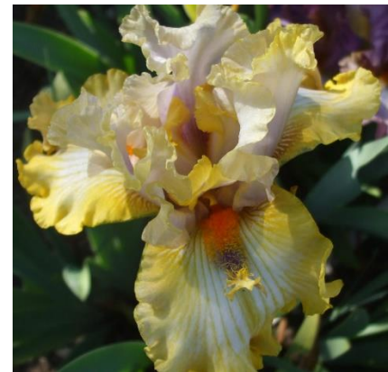
SPIRIT OF ADVENTURE (Cummins 2024), TB, 42", EM, SA. Standards misty lavender, yellow rim; style arms white and yellow; falls white, veined yellow, yellow rim; beards orange throat, lavender middle, yellow end with yellow spoon appendages.