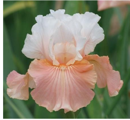
PARADISE VALLEY (Schreiner 2022) TB, 35", M. Standards white; falls coral; beards orange; slight fragrance.