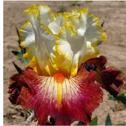
SINGULARITY (Sutton 2023) TB, 36", E-M-L. Standards white, 1/2" gold gilt edge; style arms white, brushed gold on crest; falls currant red, white zones are veined crimson, yellow center stripe from beard; beards orange; slight sweet fragrance.