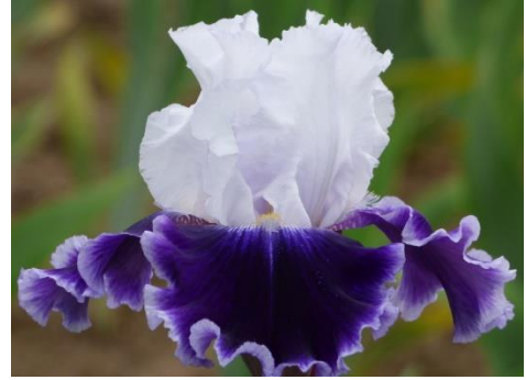
LOCAL OCEAN (Schreiner 2024) TB, 40", L. Standards white; style arms cool lavender; falls purple; beards yellow; tinted foliage; slight fragrance.

falls burnt orange; beards burnt orange; slight fragrance.